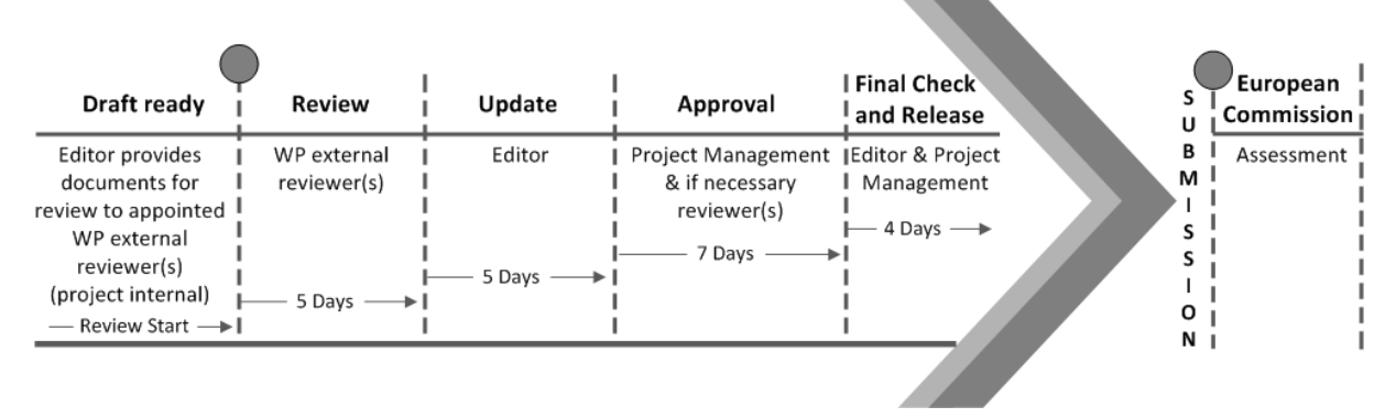
Figure 8: Internal Review Process

To ensure quality of Deliverables an internal review process has been defined. The main goal of this process is to establish internal feedback by partners who did not directly participate as editor to the Deliverable before submitting the Deliverable to the European Commission. The review process is shown and explained below.